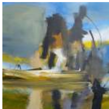
Map of the Wind #14