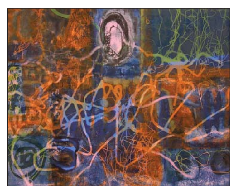
"Le Cabinet de Curiosite."