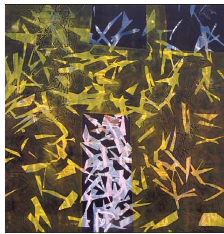
"One Thousand Pieces I."